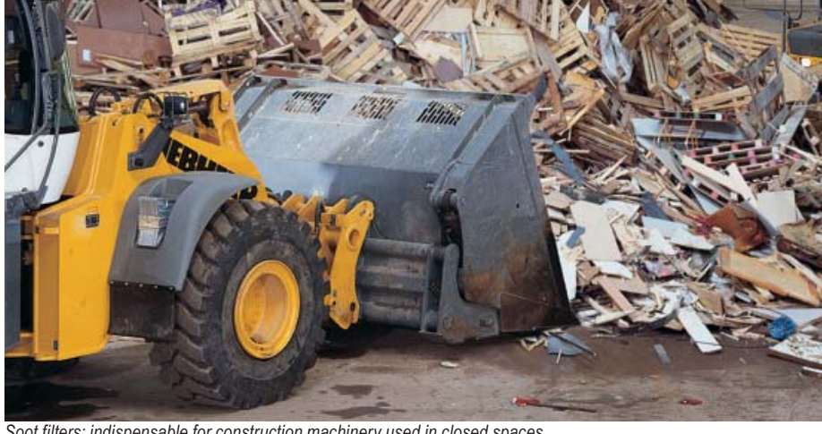
Soot filters: indispensable for construction machinery used in closed spaces

Liebherr's robust, high-power diesel engines are used primarily in the company's earthmoving equipment, mobile cranes and special machines. They are characterised by advanced technology and precise machining.