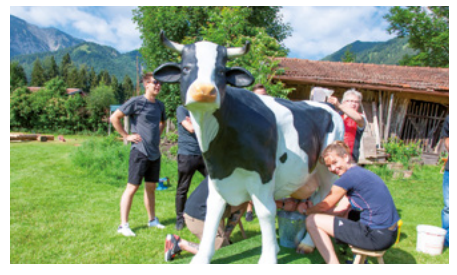
could muster, while both skill and speed decided the day when it came to pretzel-catching. Next we took aim with laser rifles in the biathlon event, proving that we don't just stay cool under pressure in the lab or at our desks.

We mastered milking with all the dexterity we