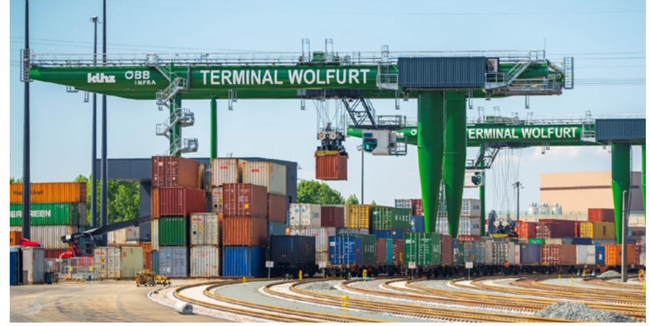
Künz container cranes at Wolfurt Freight Centre deliver higher loading capacities with significantly lower operating noise.

Austrian firm Künz GmbH has decades of experience in crane construction, which it uses to provide its exacting clients throughout the world with technically and qualitatively firstclass products. Whether crane systems for handling containers or rails, electrolysis cranes for zinc, copper, and nickel production or hydraulic steel equipment for constructing and renovating hydroelectric power plants, Künz has the perfect solution for every sector. Following purchase, Künz customers receive an individually tailored maintenance package. The Künz Information System (KIS) is designed for predictive maintenance. This not only enables maintenance work to be carried out efficiently in advance, but also provides important operating information to keep machinery running smoothly. OELCHECK lubricant analyses are an indispensable component of this.