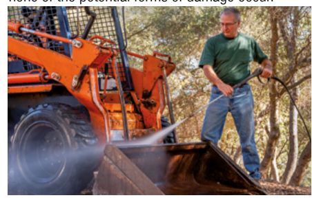
Water is one of the most common causes of damage to hydraulic systems

Its strong polarity and significantly contrasting density mean that water normally separates quickly from oil. Separation may however be negatively affected by additives and impurities. An excess of water – in hydraulic systems, over 500 ppm – should separate quickly from the oil, allowing it to be diverted to the deepest part of the tank so that it does not participate in oil circulation. For HLP hydraulic oils, the hydraulic oil standard specifies a maximum water separability of 30 minutes. Modern water separators then enable the water to be removed from a hydraulic tank in such a way that none of the potential forms of damage occur.